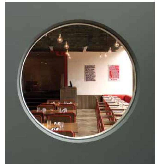
Made in Camden