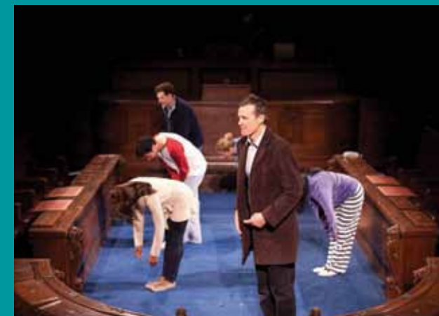
Roundhouse CircusFest, Inside, Counted?