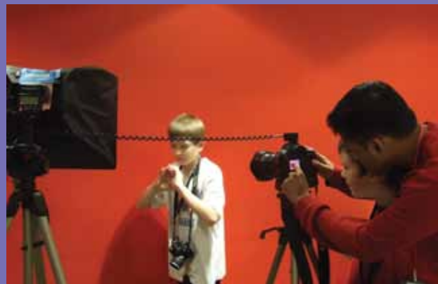
Roundhouse Radio: Arts Attack from the Fourth Plinth, Roundhouse Radio Studio, Primrose Hill Primary School after-school photography project