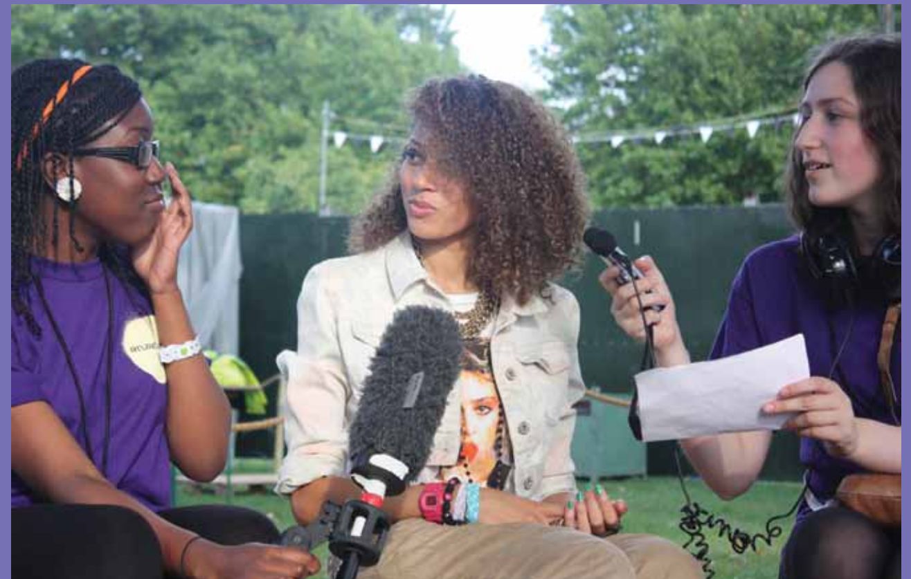
Introduction to Radio project, Underage Festival Reporters project