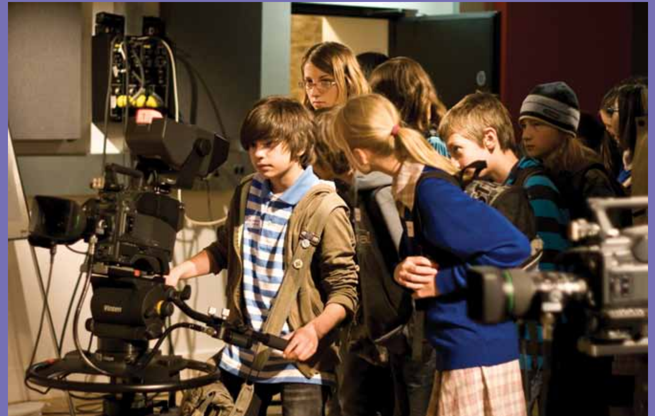
Schools media taster day