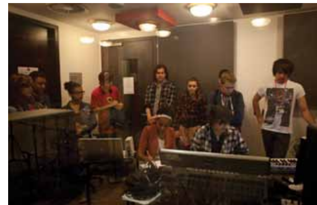
Fuerzabruta, David Byrne's Playing the Building, Other Side of the World music project