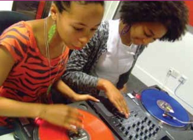
Previous page: Ms Dynamite at Turning Point 2010 This page: Roundhouse Hip Hop Musical, Beat 2006, DJ drop-in session