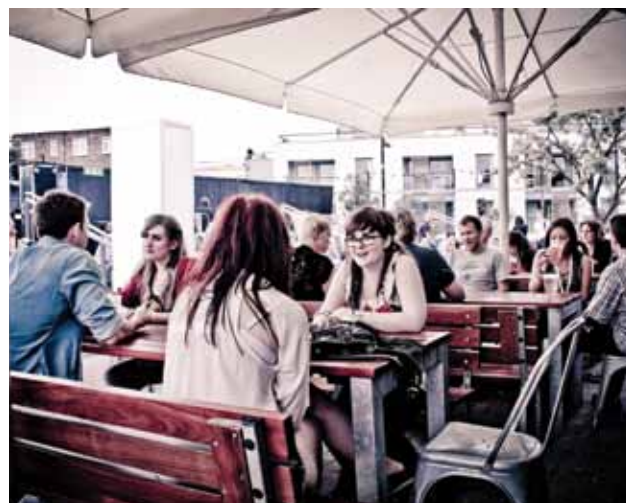
Volunteer usher, Roundhouse Terrace