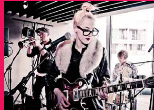
Swedish House Mafia at iTunes Festival, Beth Jeans Houghton at Short Circuit Festival, Gorillaz

Over five years, the Electric Proms delighted audiences at the Roundhouse, and many millions worldwide, with an extraordinary line-up of some of the world's best-loved musicians and exclusive collaborations. The final year featured Neil Diamond, Elton John and Robert Plant.