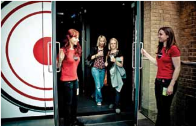
Staff, the Roundhouse, volunteer ushers, Roundhouse Terrace