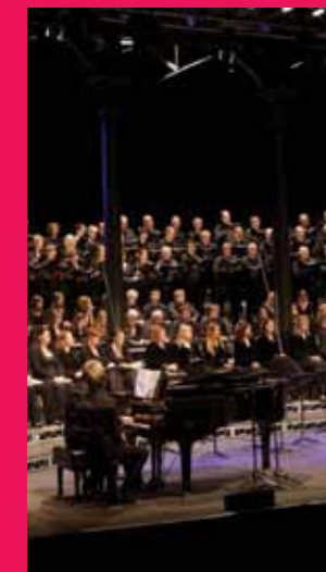
Audience, Dweezil Zappa at Frank Zappa 70th Birthday Celebration, LCO play Metropolis, BBC Singers, Roundhouse Choir & London Symphony Chorus at Voices Now