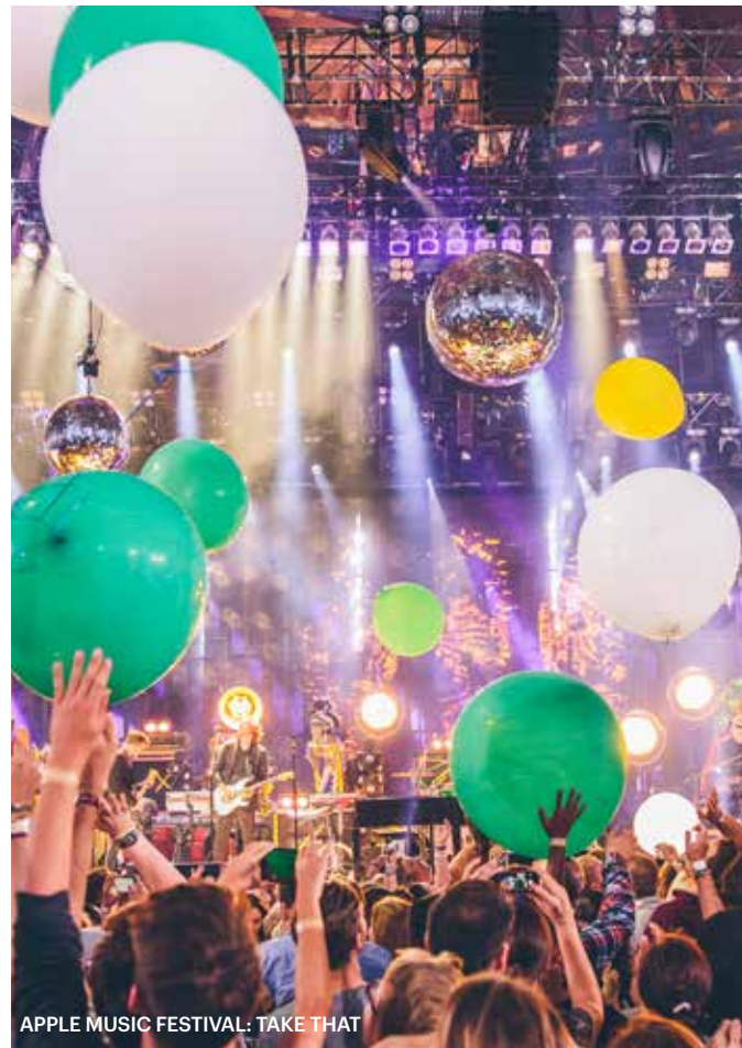
APPLE MUSIC FESTIVAL: TAKE THAT