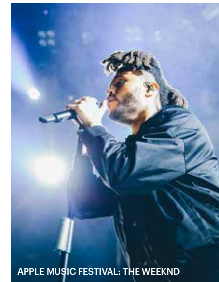
APPLE MUSIC FESTIVAL: THE WEEKND