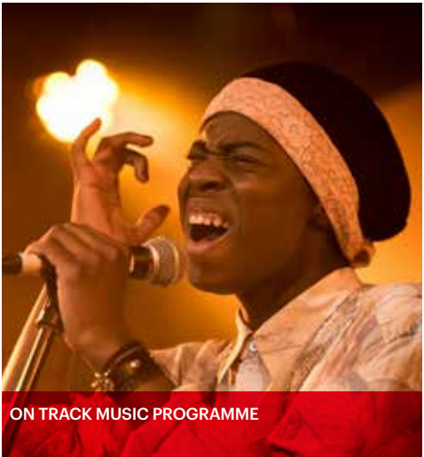
ON TRACK MUSIC PROGRAMME