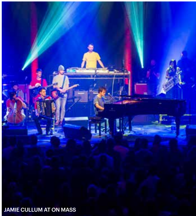
JAMIE CULLUM AT ON MASS

“The night erupted with young musical talent”