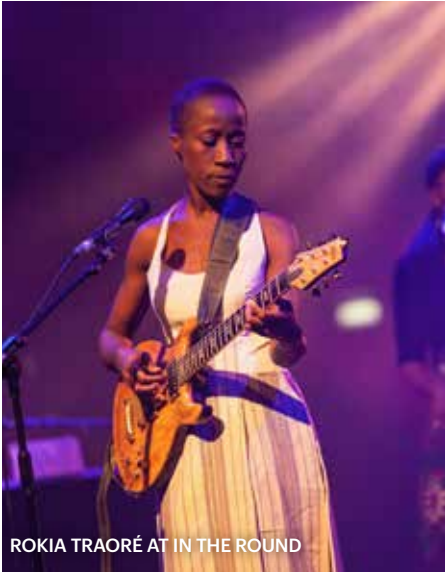
ROKIA TRAORÉ AT IN THE ROUND

Telegraph on Rokia Traoré at In the Round