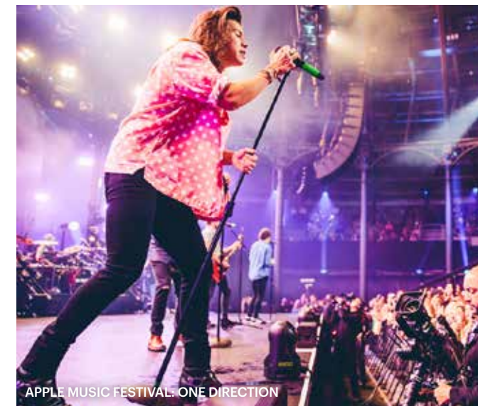
APPLE MUSIC FESTIVAL: ONE DIRECTION