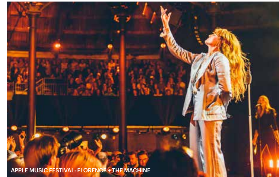
APPLE MUSIC FESTIVAL: FLORENCE + THE MACHINE

“Increasingly, some of the most interesting theatre is being made by and with young people, and this show is part of that trend”