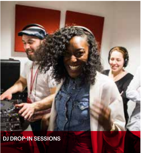
DJ DROP-IN SESSIONS