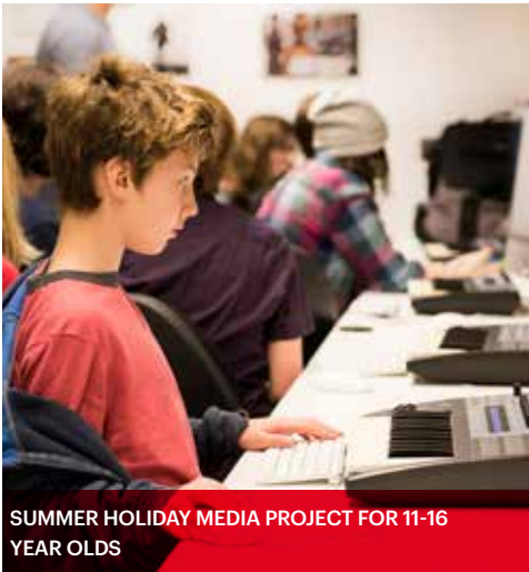
SUMMER HOLIDAY MEDIA PROJECT FOR 11-16 YEAR OLDS