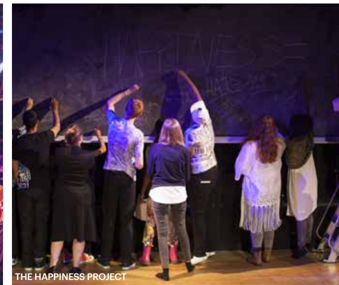
THE HAPPINESS PROJECT