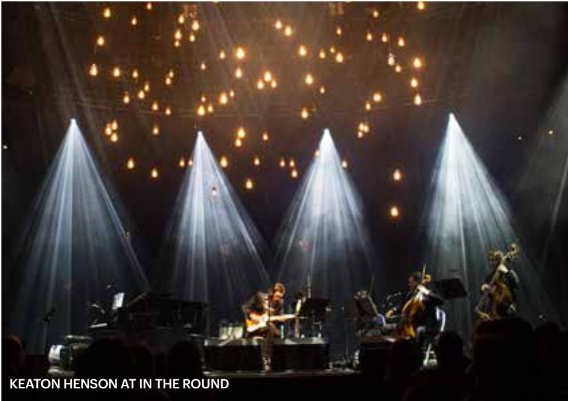
KEATON HENSON AT IN THE ROUND

“His intimate songs were perfectly suited to the venue's all-seated In the Round series”