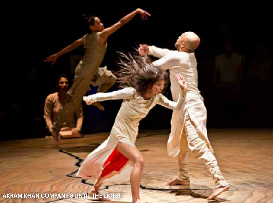
AKRAM KHAN COMPANY'S UNTIL THE LIONS

Evening Standard on Keaton Henson at In the Round