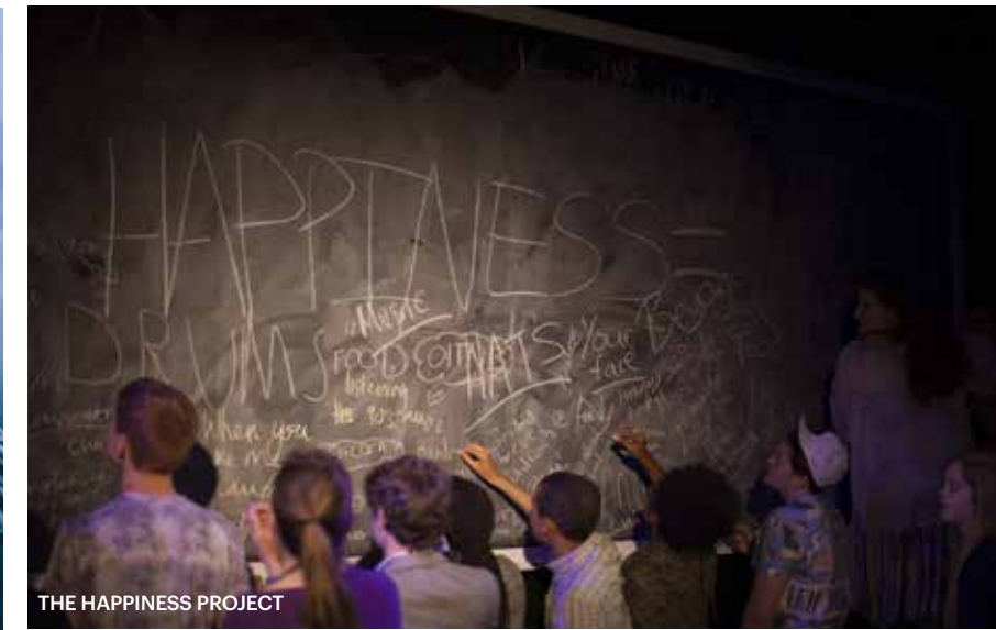
THE HAPPINESS PROJECT