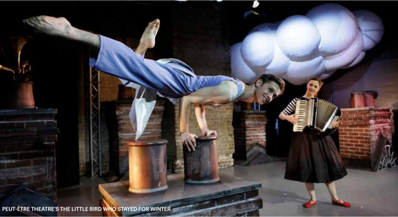
PEUT-ÊTRE THEATRE'S THE LITTLE BIRD WHO STAYED FOR WINTER

“A perfect theatrical experience for any youngster. Immersive, visually spectacular.”